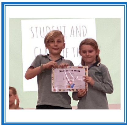
Class of the Week: Lilly Pilly