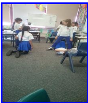
Stage 2 3/4 Lilac Drama lesson