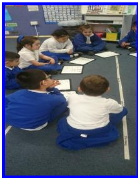
Early Stage 1 Kindy Blue Sharing ideas