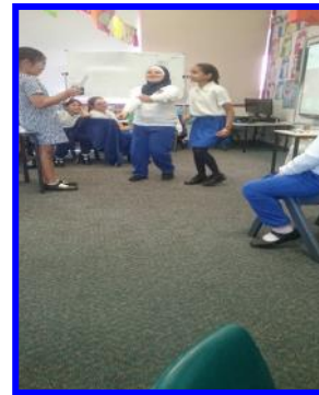
Stage 2 3/4 Lilac Drama lesson