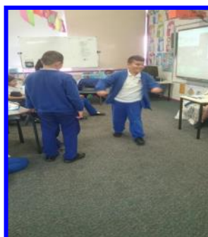
Stage 2 3/4 Lilac Drama lesson