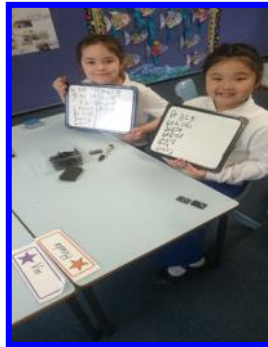
Early Stage 1 Kindy Blue sharing ideas