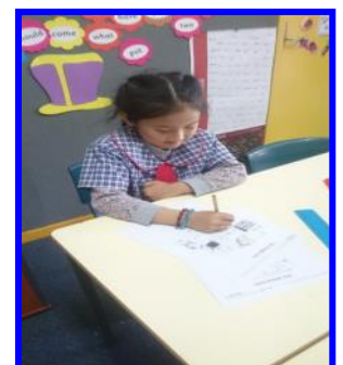
Stage 1 Learning new vocabulary