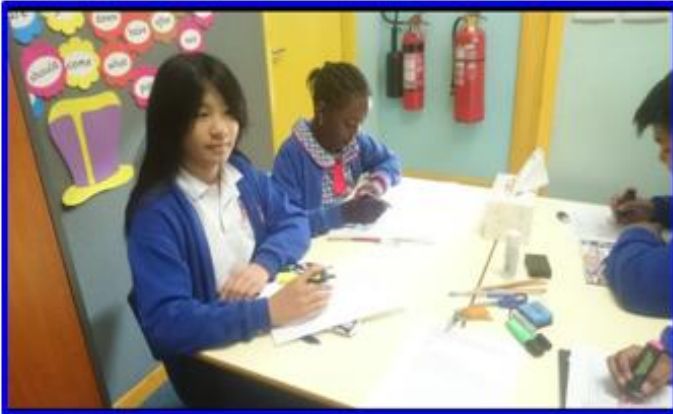
Stage 3 working on sentence structure.