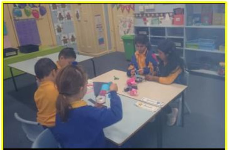
Early stage 1 working in groups.