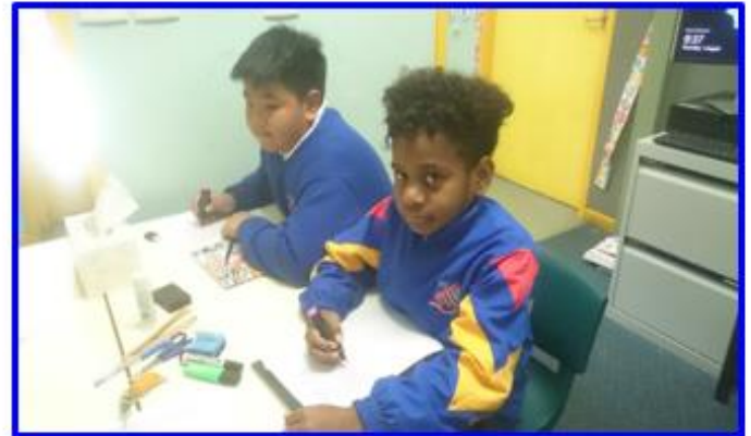
Stage 3 working on tense.