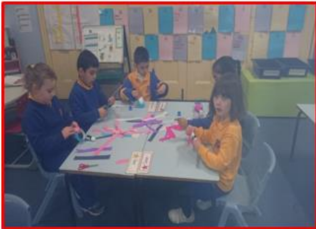
Collaborative planning to make paper chains.

The students are engaged in activities across different stages.