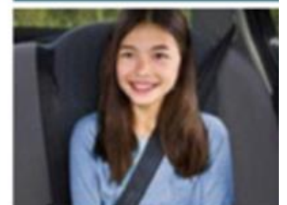
145cm or taller Suggested minimum height to use adult lap-sash seatbelt