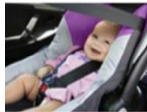
Up to 6 months Approved rear-facing child car seat