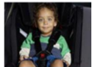
6 months to 4 years Approved rear- or forward-facing child car seat