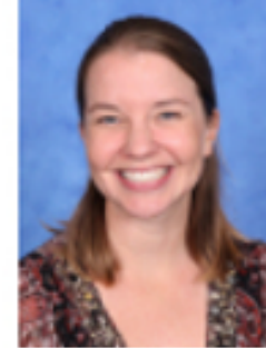
Rebecca Seelinger Library