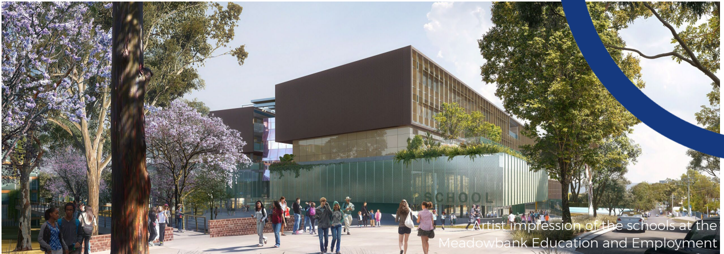
Artist impression of the schools at the Meadowbank Education and Employment Precinct