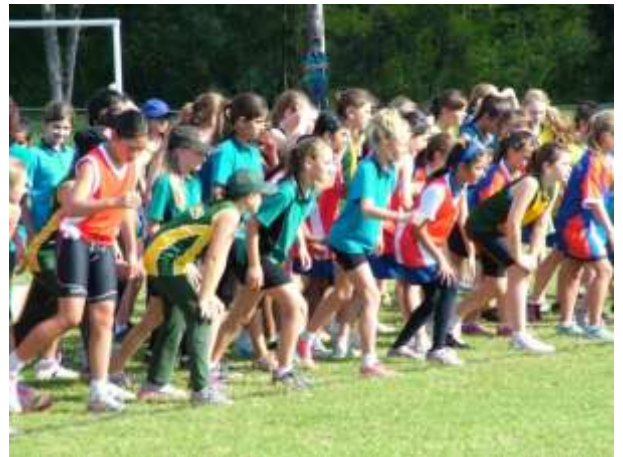
On your mark, get set, go!