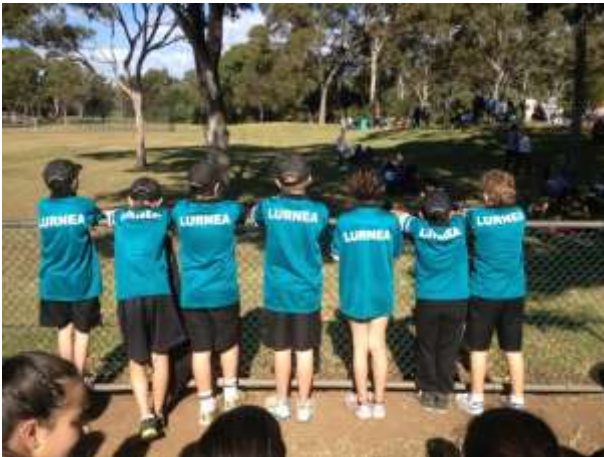
Students supporting the participants from Lurnea

A big thank you to all the parents, relatives and friends who attended the carnival to support our students on the day.