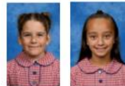
Education & Communication Ministers – Willow, Phoenix