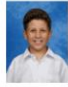
Prime Minister - Dawud