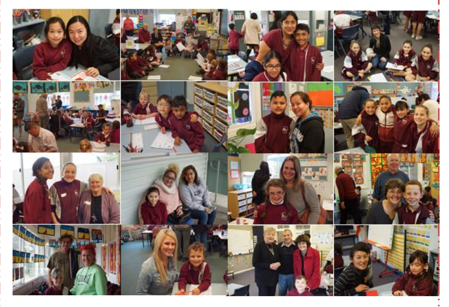
Open Classrooms were very popular with our families. Then it was time for our Performances