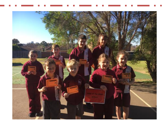
Week 2: Safety Week