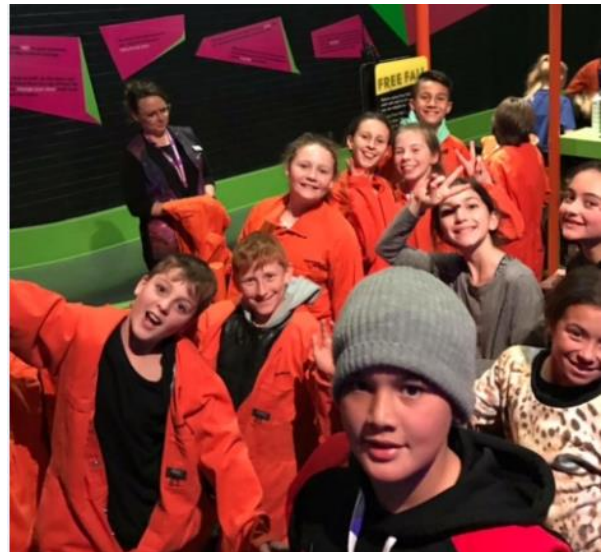
Fun in the Snow and at Questacon