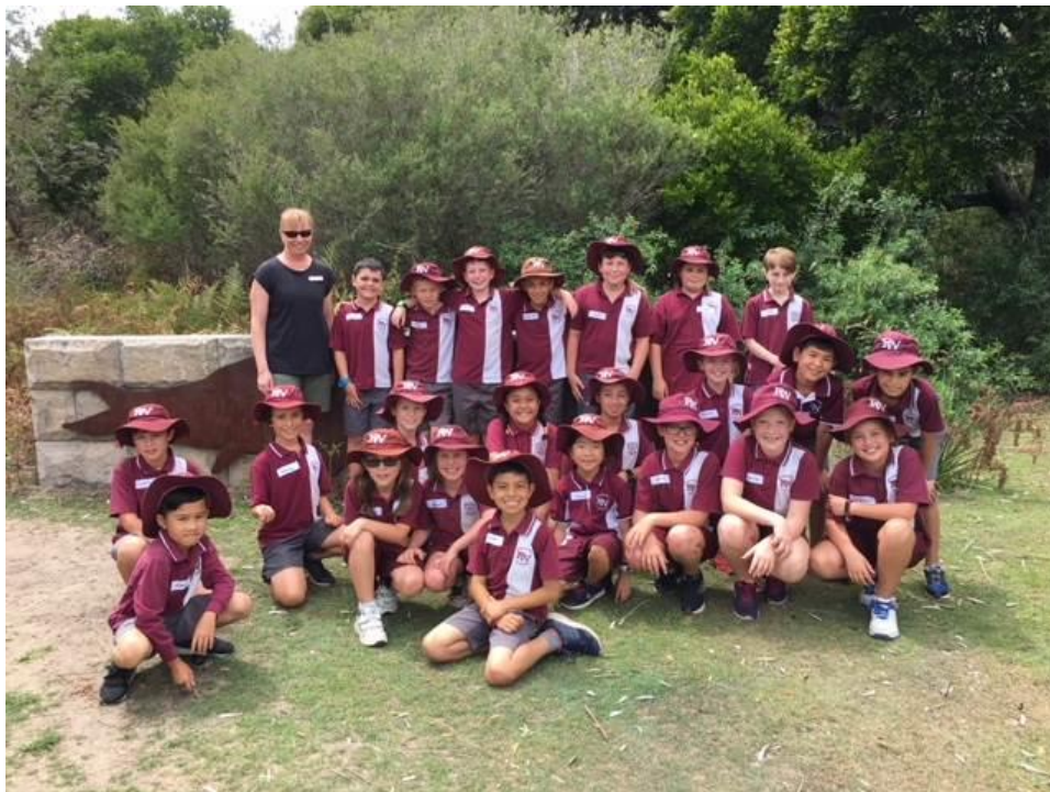
Stage 2 Excursion