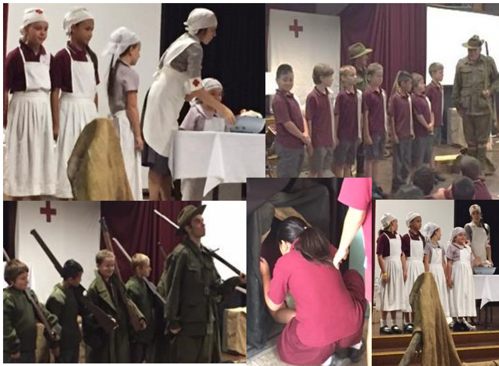
School Incursion - ANZAC Performance