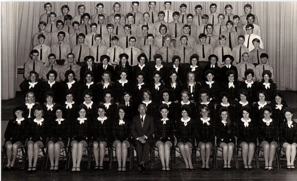
The Gleam – 1969, The Magazine of Wollongong High School, page 39