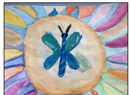
Isabella-Rose - Gaze of Spring