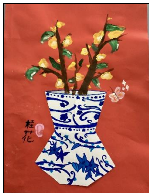
Audrey - Flower of Happiness