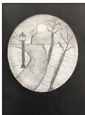
Nusaiba - The Gloomy Path