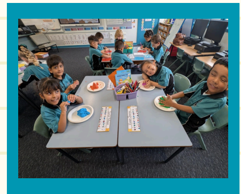
Fine motor activities in KJ