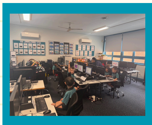
KF's first session in the computer room.

Please remember to return your book each week and bring a library bag!