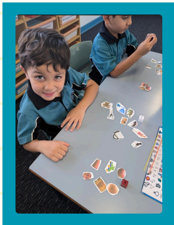
Sorting activities in KJ