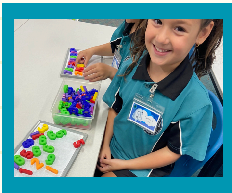
Investigating numbers in KL.