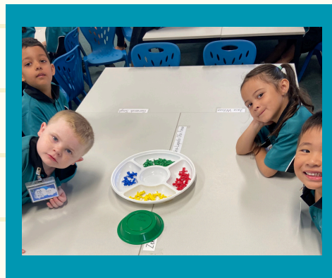
Sorting activities in KL