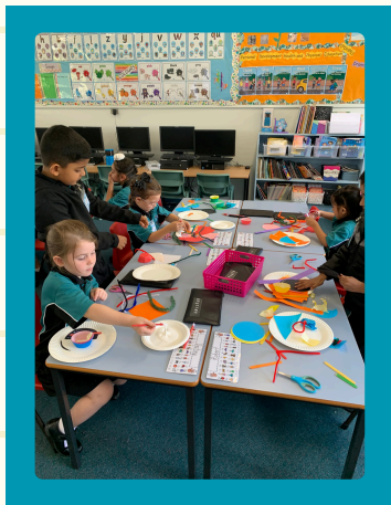
Creative craft in KC