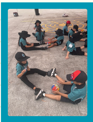
KF practising their ball skills