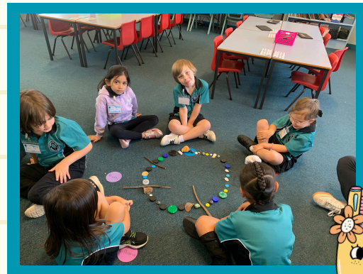
Investigating patterns in KC

In Numeracy so far we have been investigating sorting, patterns and encouraging the students to notice that maths is all around us. Literacy has focused on making connections to stories that we read and responding to them by sharing our experiences, talking about our ideas and recording with drawings. We have started learning some of our single sounds and practise forming letters correctly everyday!