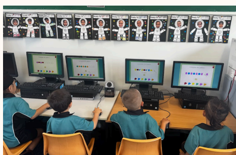
Maths - Completing patterns on the PC.