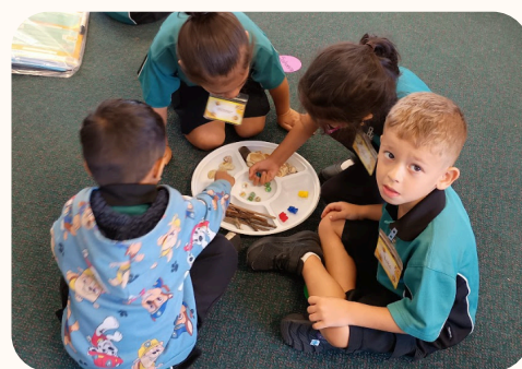
Maths activity - sorting and organising