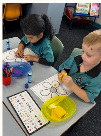
Scrunching tissue paper to decorate flowers in art