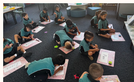
Practising writing our names correctly.