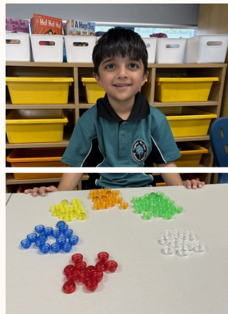
Maths - Sorting by colour