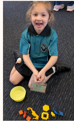
Maths - sorting objects