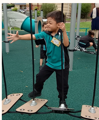
Using our skills on the Ninja Course