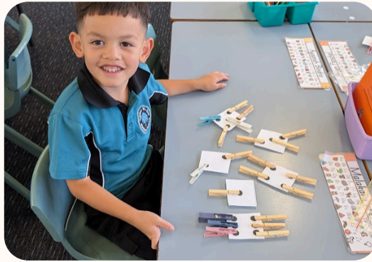
Maths - subitising skills!