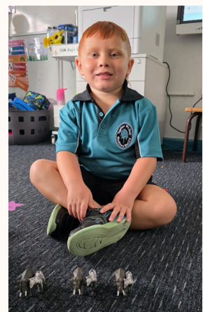
Maths - Making patterns