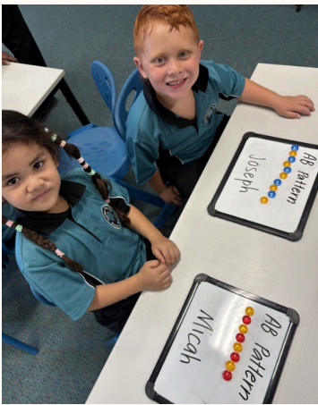
Maths - Making patterns