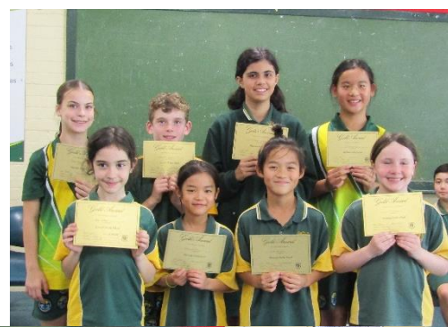
ADVANCE AUSTRALIA FAIR