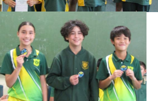
ADVANCE AUSTRALIA FAIR