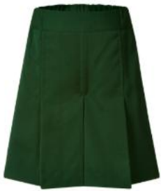
Rose Box Pleat Gaberdine Shorts $31.90